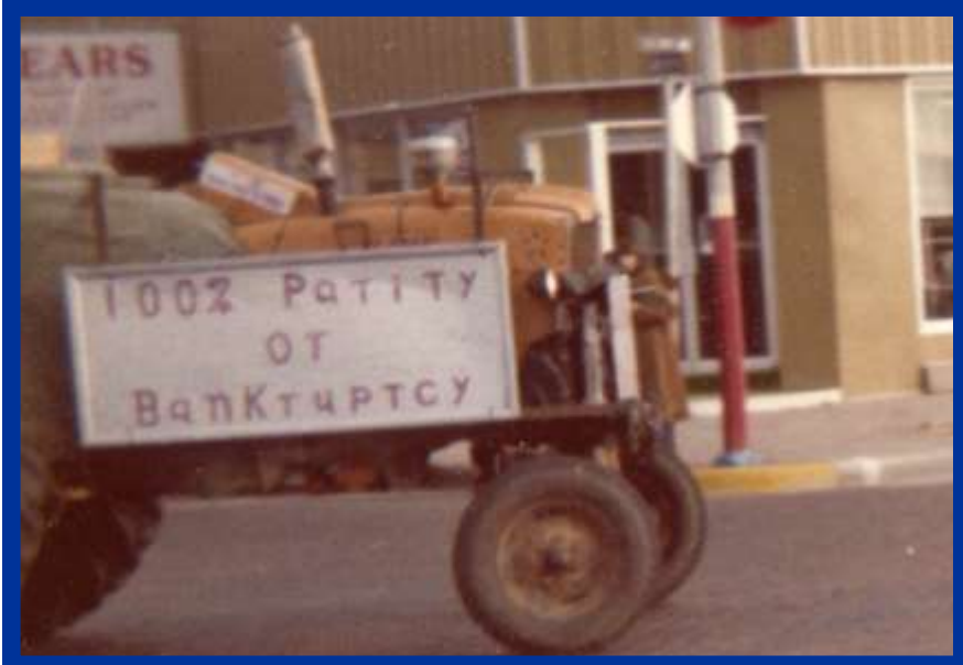
Jack Wolfe "100% Parity or Bankruptcy"