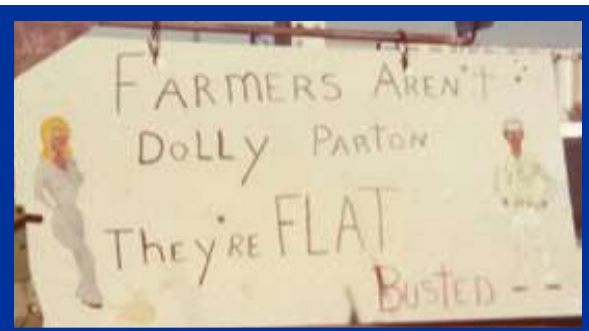
Alvin Wheaton "Farmers Aren't Dolly Parton, They're Flat Busted"