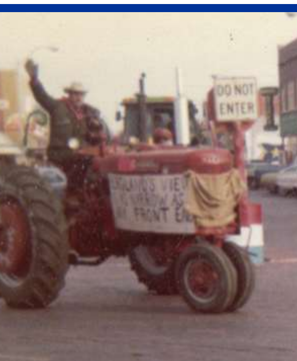
Ed Scheufler "Bergland's view is as narrow as my front end"