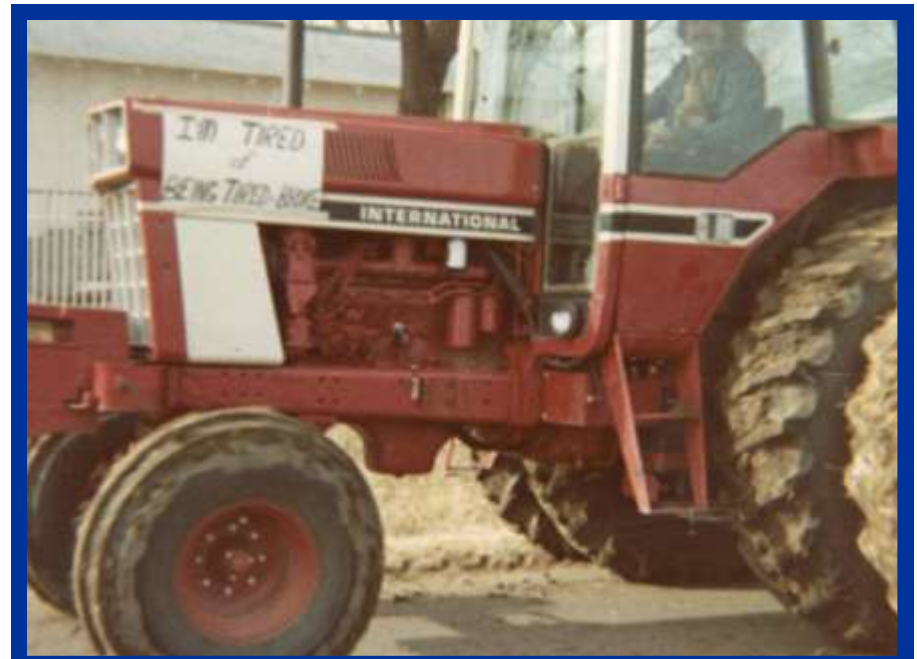
Lyle Lightcap "I'm tired of being tired"