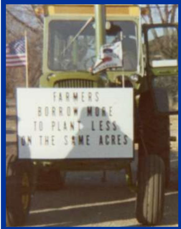
Darrel Miller "Farmers borrow more to plant less on the same acres"