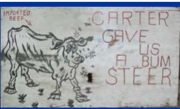
Ed Scheufler "Carter gave us a bum steer"