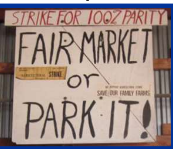
Jeff Mead "Strike for 100% Parity Fair Market or Park It"