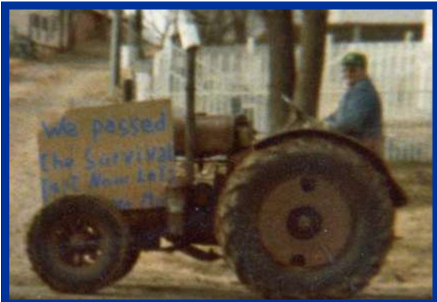
Alvin Wheaton "We passed the survival test Now let's make money"