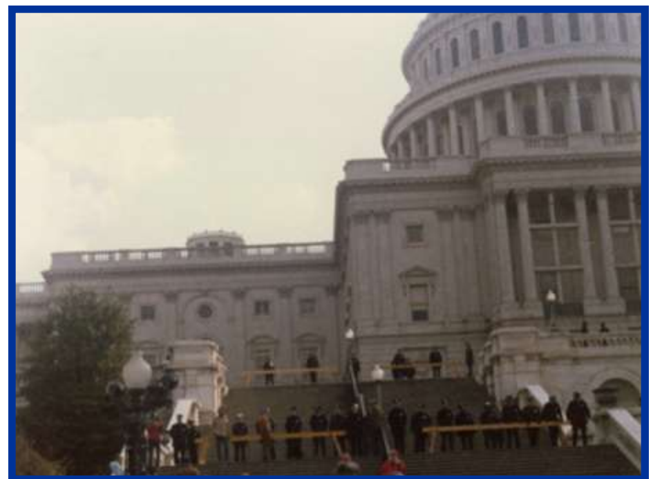
Police in full riot gear on all the Capitol steps and roof