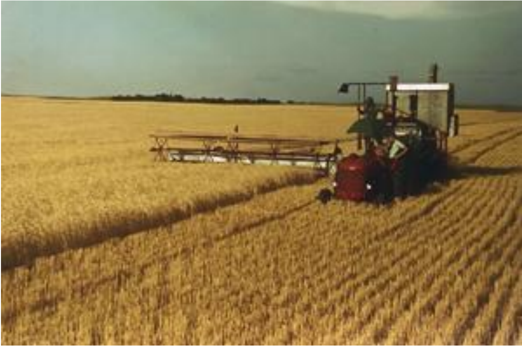
c. 1945 - 20' Avery combine harvesting on Mundhenke property, 160 Ave. & P Rd, Lewis