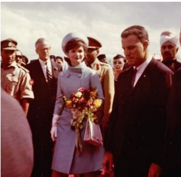
Meeting and talking with Jackie Kennedy in Lahore March 21, 1962