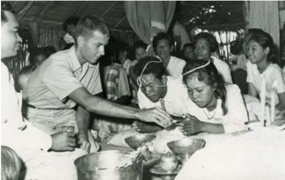
Thailand – Pouring holy water at a Buddhist wedding