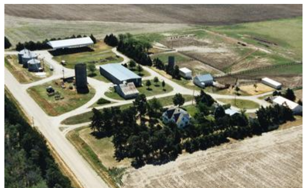
Mundhenke homestead, Lewis, Kansas 100 years and four generations