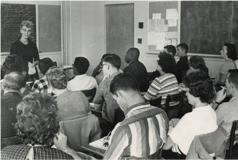
1961 Peace Corp traing at Ft. Collins, Colorado