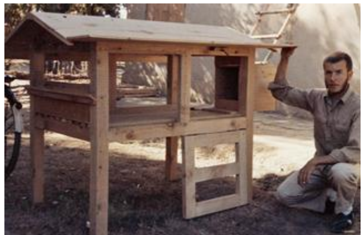
Boyd in West Pakistan helping build chicken pens