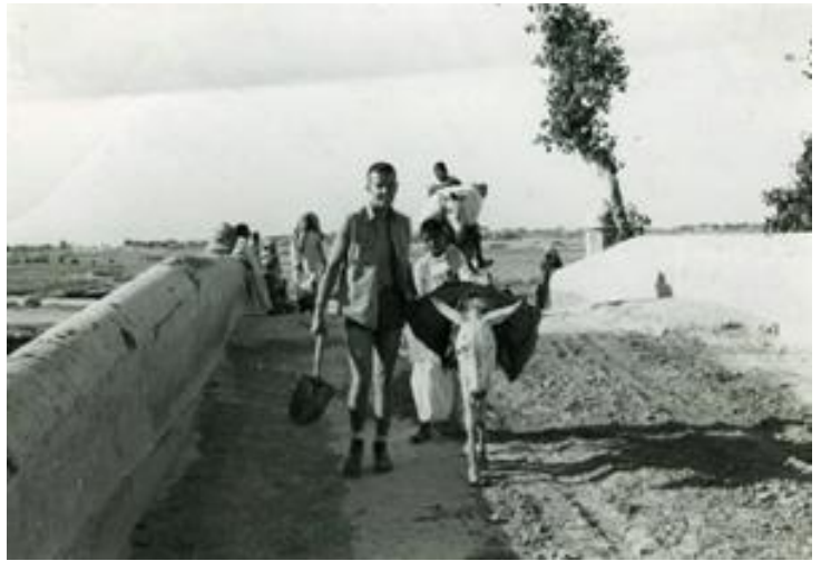
"Me & my donkey. It usually took a shovel across his rear to inspire him to move. This was in the evening just before swimming break. We didn't wear many clothes because we only worked mornings and evenings."