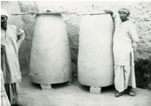
Punjabi mud storage bins for wheat