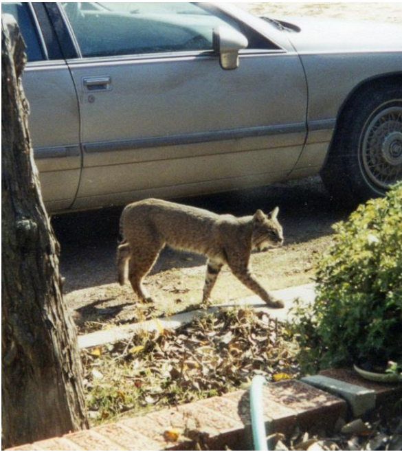
A visitor in the 2000's