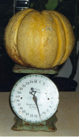
A 11+ pound cantaloupe grown by Jack